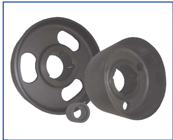
Flat belt pulleys for TL-bushes