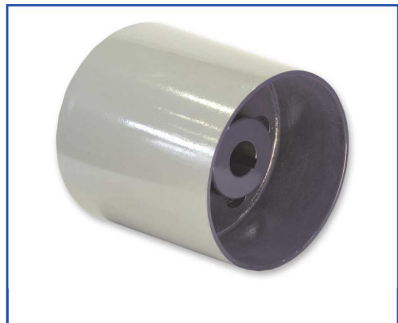
End-tapered pulleys (paper machine)