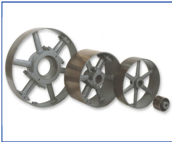
Flat belt pulleys, special design